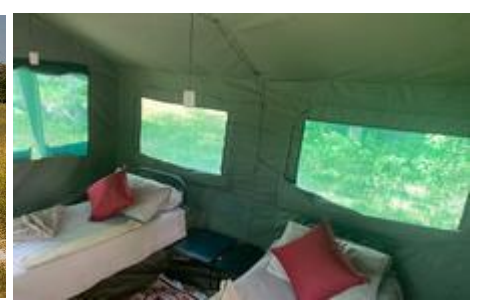
Day 9-11 Planet Baobab - 2N Dry Season Package, Gweta/Makgdadikgadi