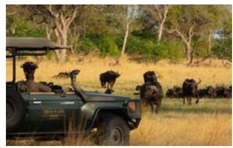
Day 4-8 Beagle Expeditions - Kweene River Camp, Okavango Delta

Following breakfast and a possible morning activity (time permitting) you enjoy a helicopter transfer flight to Kweena Trail for your four night mobile camping safari ahead.