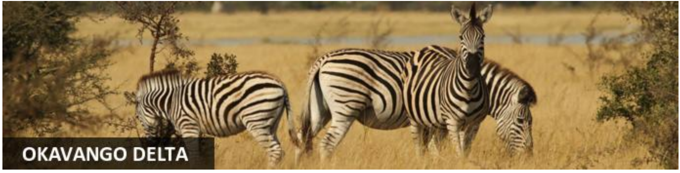
The Okavango Delta is where the wild things are: an immense, waterlogged oasis alive with elephants and

Following breakfast and a possible morning activity (time permitting) you enjoy a helicopter transfer flight to Kweena Trail for your four night mobile camping safari ahead.