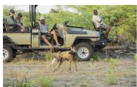
Day 8-10 Karangoma, Okavango Delta

Following an early morning activity, time permitting, and breakfast you helicopter transfer to Karangoma where you spend the following two nights on a fully inclusive basis.