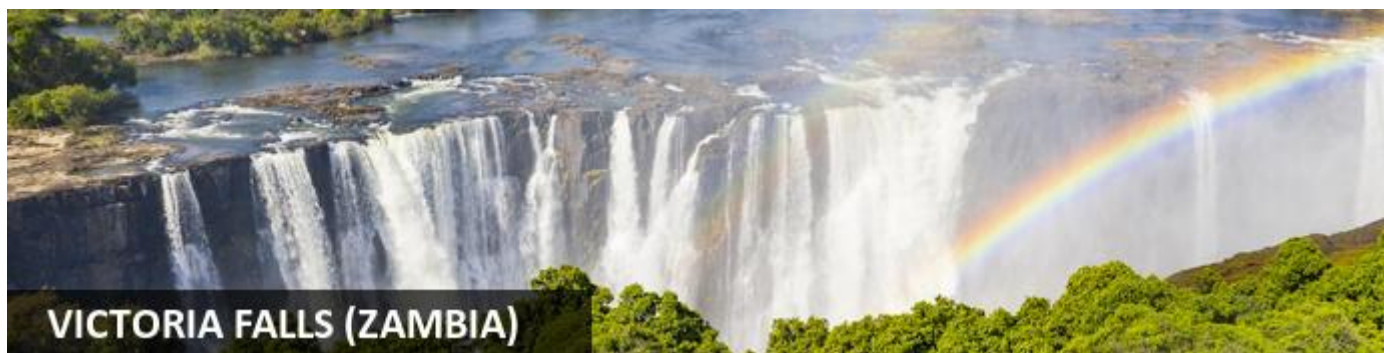
VICTORIA FALLS (ZAMBIA)

At Victoria Falls, the earth splits open and swallows one of Africa's greatest rivers, the mighty Zambezi, creating the largest sheet of falling water on earth. As the water hits the narrow depths of the Batoka Gorge beneath, it blasts a cloud of mist skywards, lending the falls their local name 'mosi-oo-tunya' (the smoke that thunders). When the Zambezi is at its fullest, the mist hangs a permanent raincloud above the falls, showering visitors on even the sunniest of days and visible for miles around.