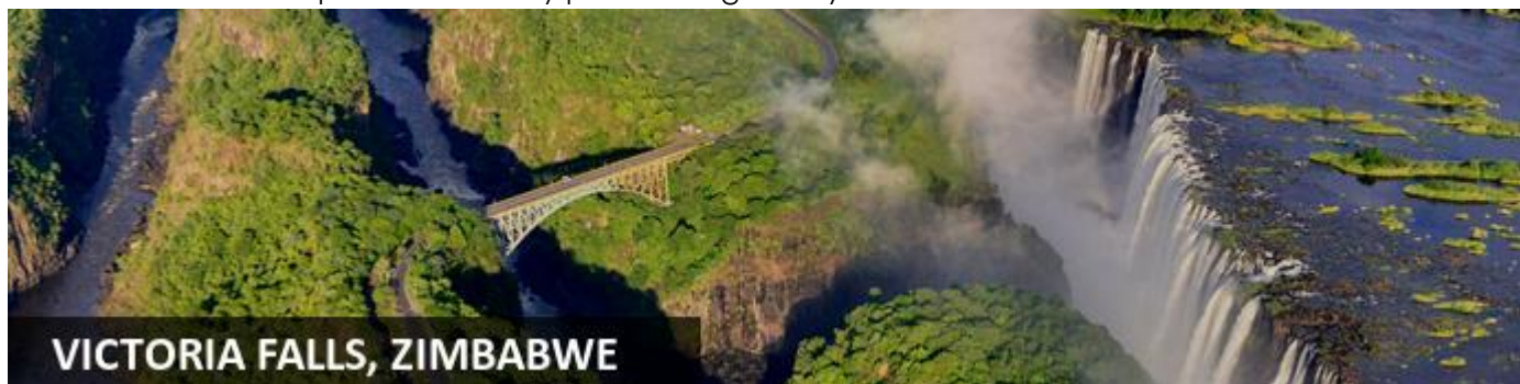
VICTORIA FALLS, ZIMBABWE

Upon arrival into Victoria Falls Airport proceed to Customs and Immigration (visa fees to be advised by your Consultant) and collect your luggage before you will be met outside the terminal by a representative from Wild Horizons for your road transfer to The Palm River Hotel. Here you spend two nights on a bed & breakfast basis. Please discuss options for activity pre-bookings with your consultant.